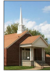
Morse Mill Baptist Church

11-15...Vacation Bible School 25-29...Day Camp at Baptist Park